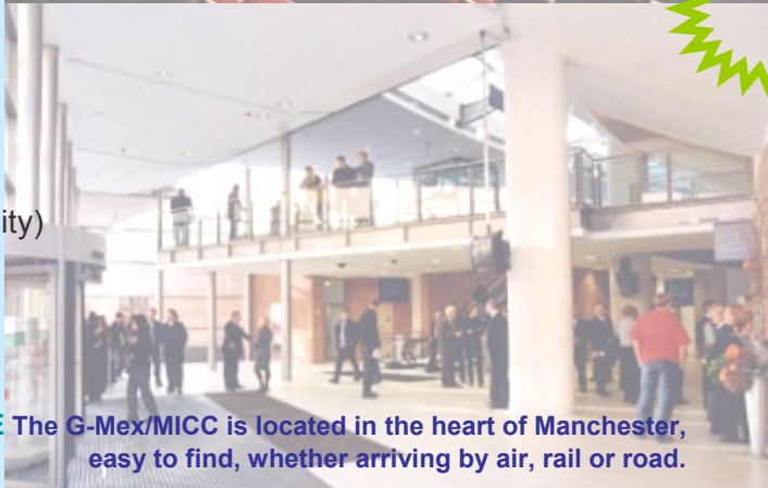
VENUE The G-Mex/MICC is located in the heart of Manchester, easy to find, whether arriving by air, rail or road.

Space is limited and we would recommend early registration Book before 31 March 2006 and receive a 36% discount